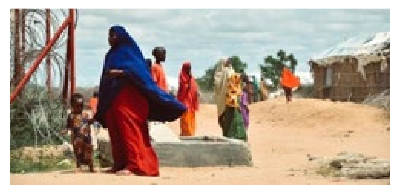
Figure 1: Somali refugees near Dagahaley Camp in Dadaab, Kenya.

on this curriculum; as such, it is the curriculum that is currently utilized by AEP's for refugees in Dadaab and Kakuma camps<sup>3</sup>.