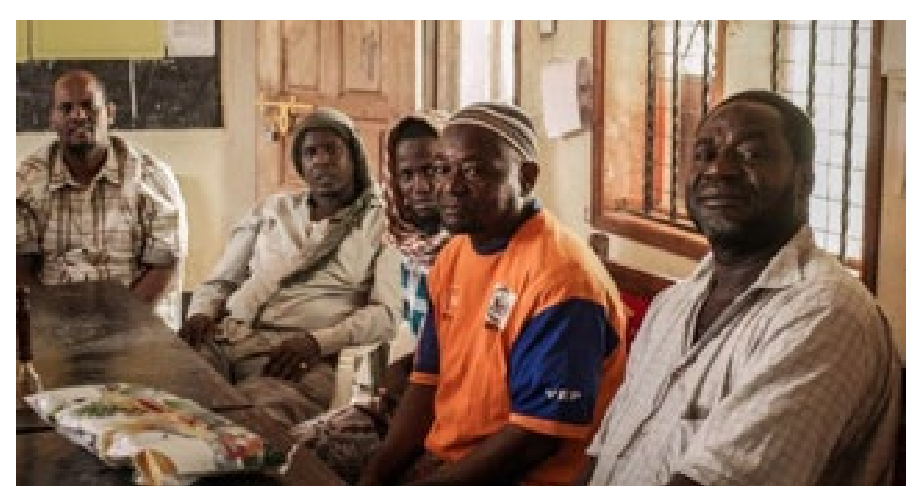
Figure 6: Some members of the PTA in Dagahaley Camp during the research FGD.

At the school level, new teachers rely heavily on the support of fellow, experienced teachers, and acceleration of curriculum occurs cooperatively, though informally. This is formalized at the NRC AEP through mentorship, with minimum weekly meetings between certified and newer refugee teachers; younger refugee teachers noted the value of these relationships and learning experiences.