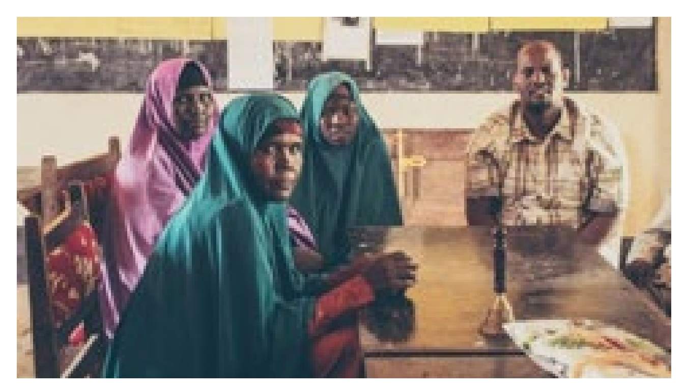
Figure 7: Additional PTA members during Dagahaley FGD.

The PTA emphasized that changing general attitudes about the value of education, especially in the protracted circumstances of Dadaab, is intense and difficult work. According to a PTA member: