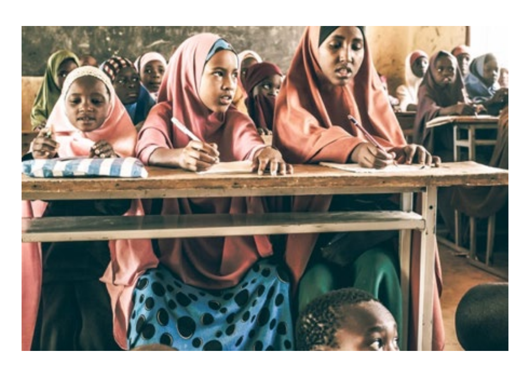
Level 1B learners in an accelerated education program classroom NRC compound in Dagahaley Camp, Dadaab, Kenya

By Jenn Flemming, Researcher AEWG Principles Field Testing