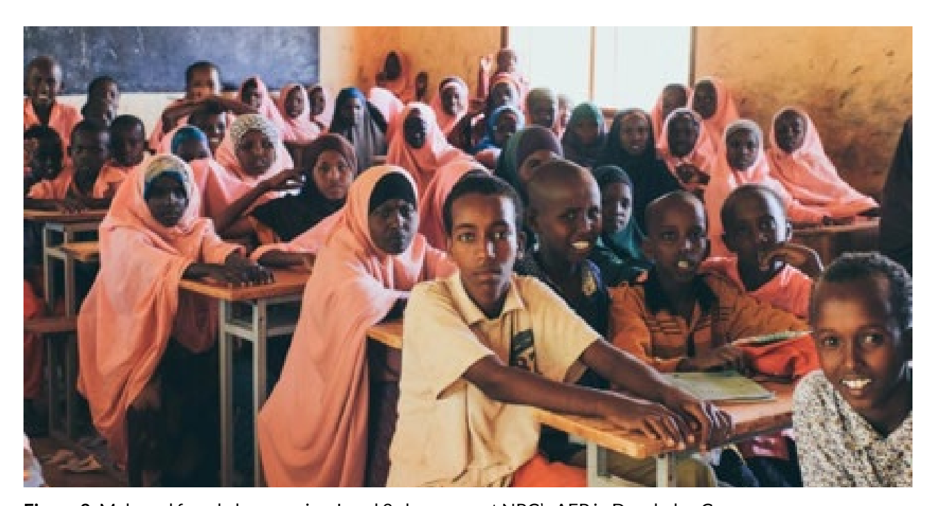
Figure 3: Male and female learners in a Level 2 classroom at NRC's AEP in Dagahaley Camp.

There are significant challenges to the utilization of AE pedagogy in the NRC AEP. Large classes (see Table 5, below) with mixed ages pose logistical challenges to interactive, learner-centred methods, and inadequate (and non-AE-specific) learning materials pose further limitations. Additionally, mixed age classrooms can present protection issues that must be addressed by teachers and school staff. In the lower level classrooms (L1A and L1B), many students were observed sitting on the floor and 5 to 6 students often shared a bench and book