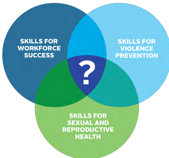
Figure 2. Cross-Sectoral Skills for Youth Development

From the youth perspective, earning money, SRH, and violence are not separate, but are interrelated in their lives, with one area of behavior often affecting the others. When youth are able to successfully negotiate their transition to adulthood by avoiding violence and negative SRH outcomes, and are able to find and sustain work, they, as well as their families, employers or enterprises, and communities benefit.