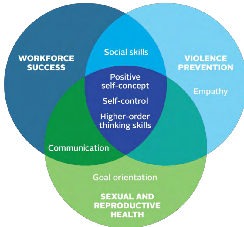
Figure 4. Cross-Sectoral Skills for Youth Development: Top-Supported Skills Across Fields

Two additional skills emerged from the review of SRH and violence prevention that were particularly important to those fields, although not present among the top 10 skills for youth success in the workforce. Empathy emerged as the skill with received the third strongest base of support in the violence prevention literature, while goal orientation emerged as the skill that received the fourth strongest base of support in the SRH literature. Figure 4 shows all seven skills according to outcome area.