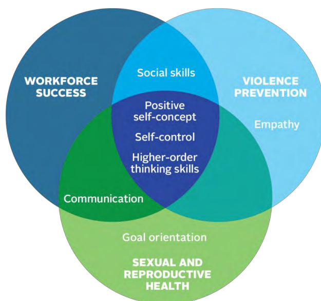
Figure 1. Cross-Sectoral Skills for Youth Development: Top Supported Skills Across Fields

Positive self-concept refers to “a realistic awareness of oneself and one’s abilities that reflects an understanding of his/her strengths and potential (and hence, is, positive)” (Lippman et al., 2015). In addition to being an important intrapersonal skill for workforce success, positive self-concept is supported by empirical evidence and experts in the field as an important skill for preventing different forms of youth violence. Positive self-concept enables youth to walk away from a fight, or successfully navigate challenging tasks and situations at work. Experts highlight that the effects of positive self-concept on violence prevention outcomes may operate through different mechanisms and may differ depending on the context.