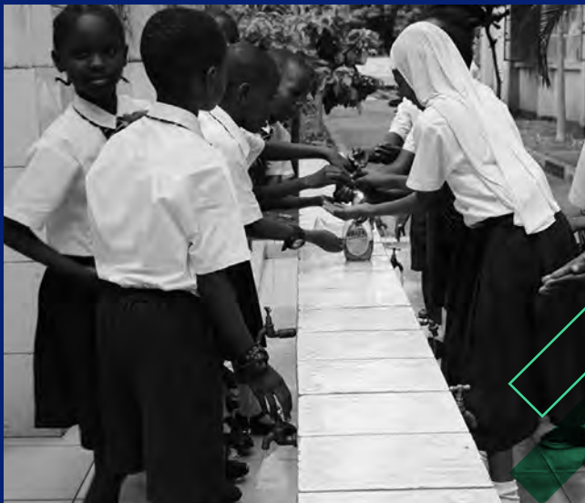
Students wash their hands at Diamond Primary School.

During the COVID-19 pandemic, health and hygiene practices have taken on new importance throughout schools in Tanzania. Historically, hygiene-related diseases have been linked to student absenteeism. The increased focus on hygiene practices is helping keep students in school.