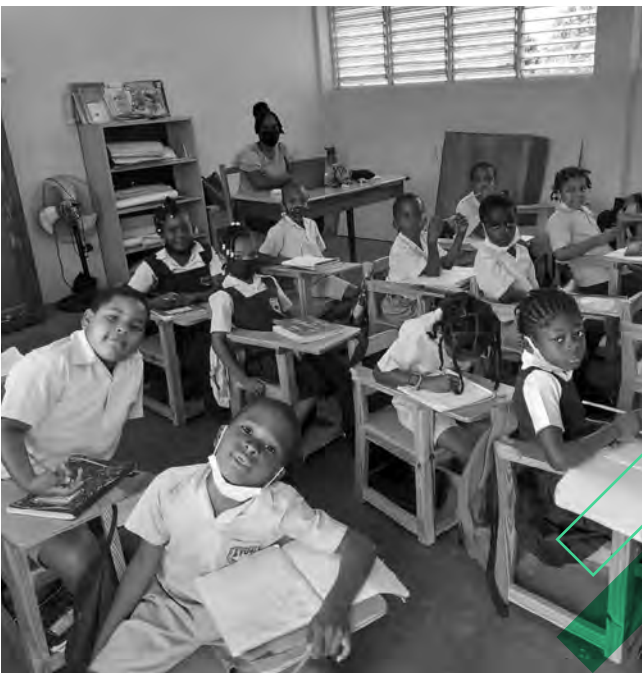
Students in St. Vincent and the Grenadines using furniture manufactured by local joiners.

Additionally, for the safe return to schools and to maintain the required social distance, it was important to make sure students had single desks and chairs. This offered another opportunity to provide income-generating activities at the community level. Through the GPE program, the Ministry of Education in St. Vincent and the Grenadines, for example, engaged local joiners to manufacture the required furniture. Through interventions like this, over 2,500 pieces of furniture were distributed to St. Lucia, Grenada and St. Vincent and the Grenadines.