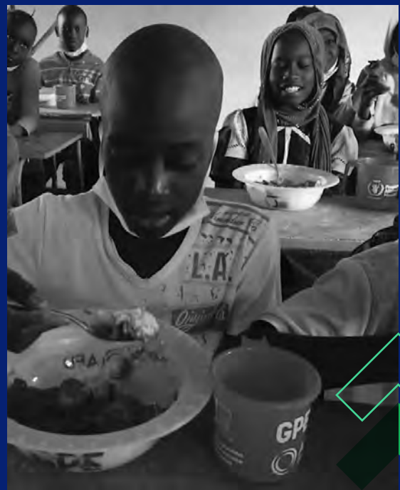
Students eating at Nguekhokh school canteen in Senegal.

Thanks to this partnership, more students in Senegal received nutritious meals during the COVID-19 crisis and were able to continue learning in school.