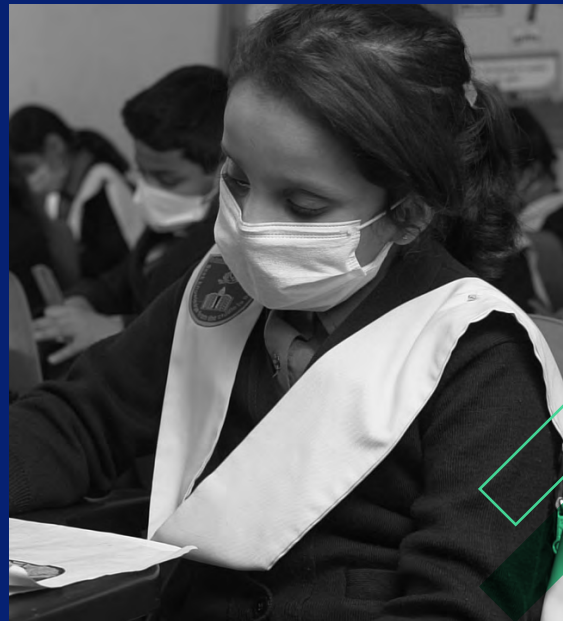
Health and hygiene protocols being followed in the classroom of a girls’ school.

But campaign messages now go beyond health and safety measures: they include promoting distance learning content, the importance of learning continuity and reenrollment, and the value of girls’ education. Mental health is also addressed by sharing information about how to cope with stress related to the pandemic.