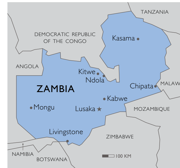
Figure 1. Map of Zambia