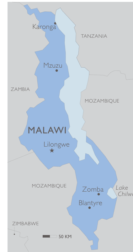
Figure 1. Map of Malawi