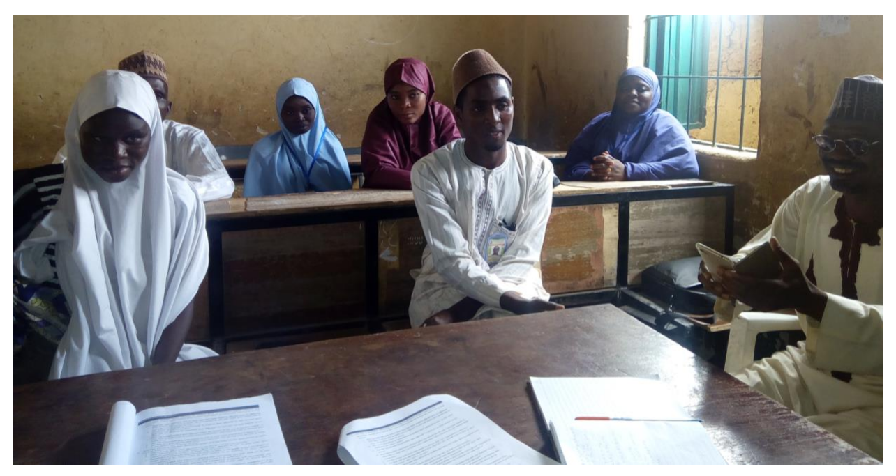
Parents explaining to the research team reasons for choosing a Tsangaya for their children.

We found that the integration of a basic education curriculum in faith-based schools helped to overcome the perception that religious schools only cater to students from the same religion or tribe. Integrated Islamiyyah schools actively sought non-Muslims. "All children are welcome here" and "we are open to all, regardless of tribe" were mentioned by teachers and headmasters. Muslim parents are more likely to send their children to a Christian or missionary school that provides basic education than are Christian parents to send their children to Islamic schools. The two Christian schools in our sample had the most diverse student bodies. The inclusion of basic education curriculum helps parents understand that providing a quality education is often the main goal of non-state schools, not proselyting.