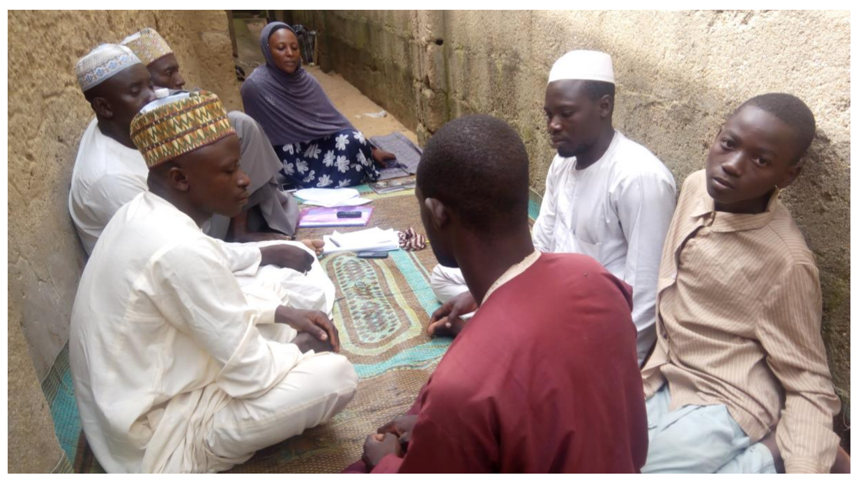
The research team conducting interviews with Ma'alams (teachers) in a non-integrated Tsangaya in Unguwan Zaria, Kaduna State.

The two Christian schools are also anchored to the local communities with large Christian populations. The Anglican Church School is located in the city center, which attracts businesses and traders from South Kaduna. The Christian school in Jemma'a is in a predominantly Christian area. Unlike Islamic schools, Christian schools are often affiliated with a church that can financially support the school. Therefore, there is less need for Christian schools to actively engage with communities to seek donations or do fund raising.