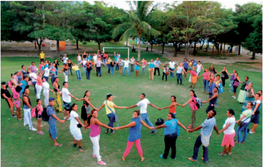
Norwegian Refugee Council Colombia Peace Culture High School Program's meeting with graduate students in Santa Marta, Colombia.