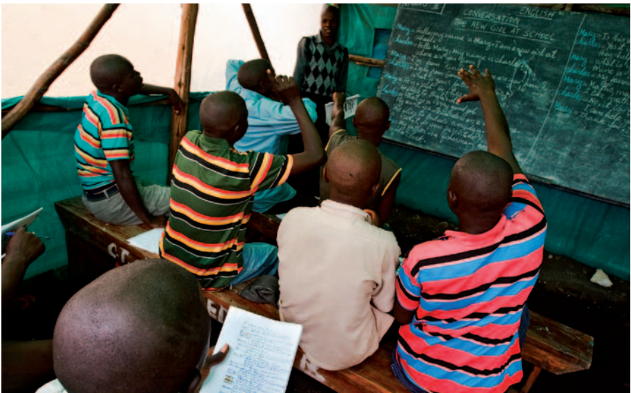
Former child soldiers attend an English class, at a transit and orientation centre run by the national NGO CAJED (Concert d'Action pour Jeunes et Enfants Défavorisés), in the eastern city of Goma, capital of North Kivu Province, Democratic Republic of the Congo.

Do programmes that include activities to improve education facilities and services take into consideration the historical and present conflict context?