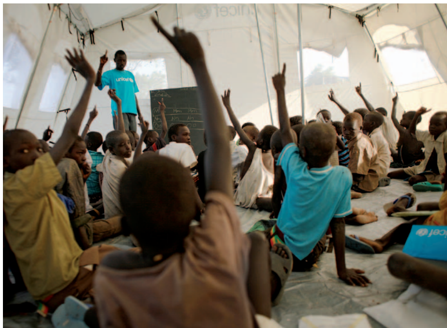
Boys who have been displaced by inter-ethnic violence attend an English class. The class is being held at a UNICEF-supported child-friendly space that is housed in a tent, in Pibor Town, Pibor County, Jonglei State in South Sudan.