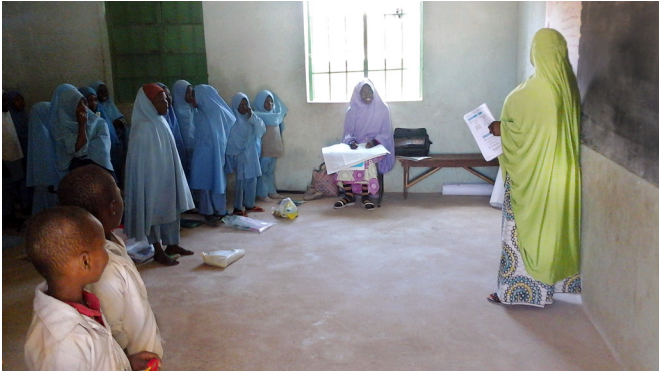
A coach observes a teacher as part of the Nigeria RARA research study.

teachers to share experiences and to engage in “mini” professional development sessions with the coach. 63 While a pilot version of this approach found that coaches and teachers appreciated an opportunity to come together, 64 as the program, NEI Plus, has grown in scale these meetings do not happen regularly due to challenges including lack of transportation, poor communication with teachers and lack of commitment on the part of some coaches. 65,66