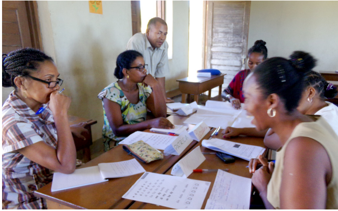
A coach in Madagascar training teachers.

Experience in EGR programs further indicates that coaches also need to possess a disposition suitable for coaching. This means being approachable, understanding the coach role, willing to meet challenges and having an interest in reading improvement. 34