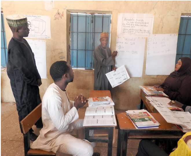
A coach in Sokoto state, Nigeria, trains teachers on a new reading initiative.