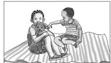
Sit Sam, sit Pat

Ensure equal representation of male and female characters.