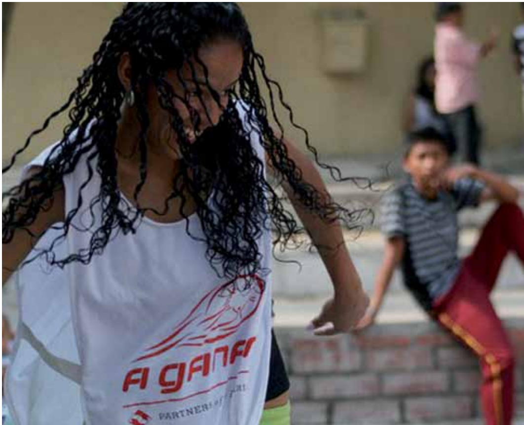
A Ganar, Partners of the Americas