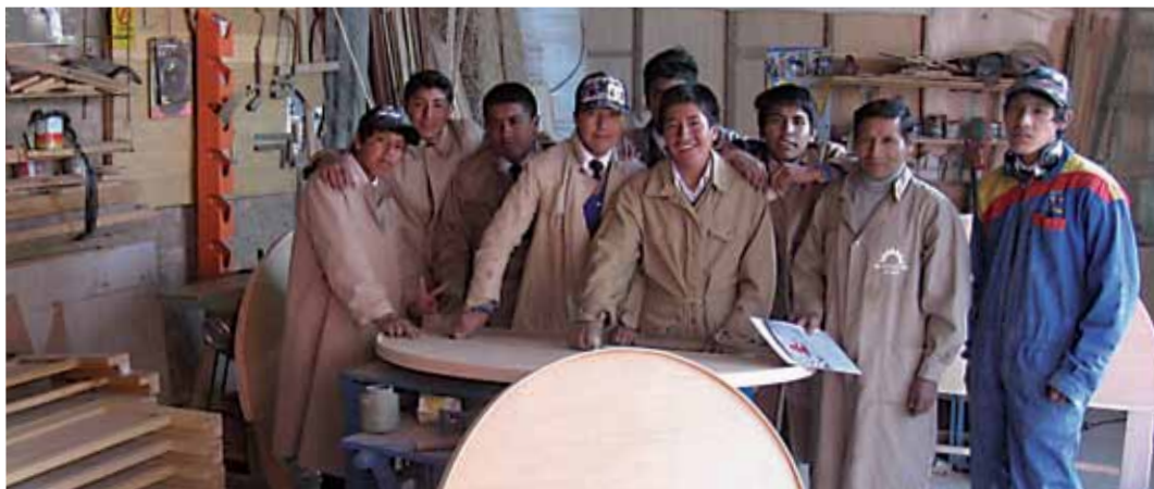
Colectivo Integral de Desarrollo