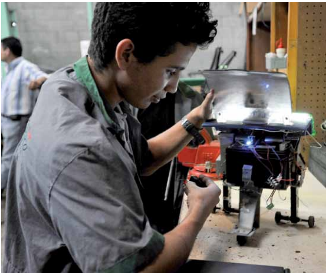
Grupo Ceiba