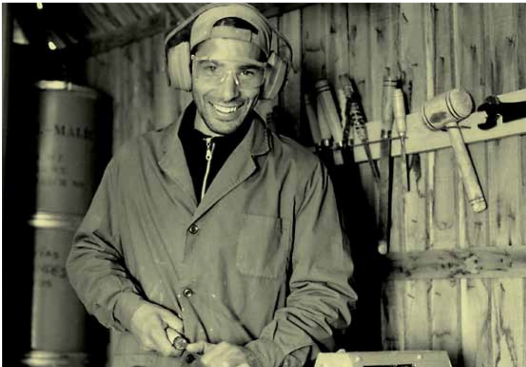
Fundación Impulsar, by Cruz Mendizabal

The MIF-YBI regional program, implemented with YBI network organizations in Argentina, Mexico, and Colombia, trained approximately 2,875 youth, of whom about 1,200 created new businesses . These new enterprises generated approximately 3,200 additional jobs, equivalent on average to 2.7 jobs per entrepreneur over their first four years in business. The average loan size in these three projects was US$ 2,000. The MIF has also replicated the YBI model in four Caribbean countries: Barbados, Guyana, Trinidad and Tobago, and Belize.