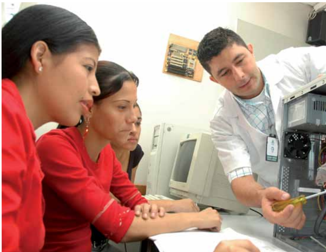
entra21, ©copyright International Youth Foundation

Keeping youth in programs. Understanding youth needs also means understanding the barriers that youth face in completing training programs, and the reasons they drop out. MIF experience has shown that efforts to locate activities close to the communities where youth live, foster family and community involvement, use interactive teaching approaches (simulations, games, role-playing, small group activities, field visits), align training with the hours best suited for the youth, and provide transportation stipends are effective in helping to keep youth engaged and minimize drop outs. Entra21 and A Ganar track dropout information using exit surveys and follow up calls to see if youth leave the program for “negative” reasons, such as lack of interest or discipline problems, or “positive” reasons, such as going back to school or getting a formal job.