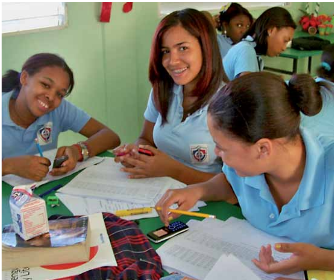
Colectivo Integral de Desarrollo