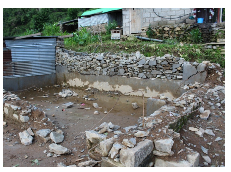
Figure 4. A Ministry of Education template design, which called for vertical rebar to be placed in stone walls, completely collapsed in every block assessed with this design. While now removed, after the earthquake, the classrooms were filled with stone from the collapsed walls.