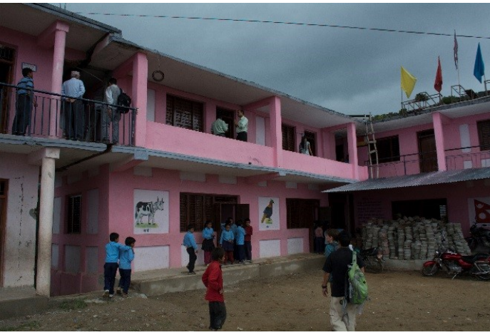
Figure 1. At a school in Kathmandu, two school buildings on the same sight performed very differently. The building on the left, a reinforced concrete frame structure with brick infill walls, was moderately damaged and received a red tag. Its frame joints and infill walls will need to be repaired before the building can be reused for classrooms. The building on the right, an adobe and stone masonry structure, was recently retrofitted with stitch banding. It was undamaged and immediately able to be reopened, despite being made of a weaker building material. The retrofit proved to be successful.