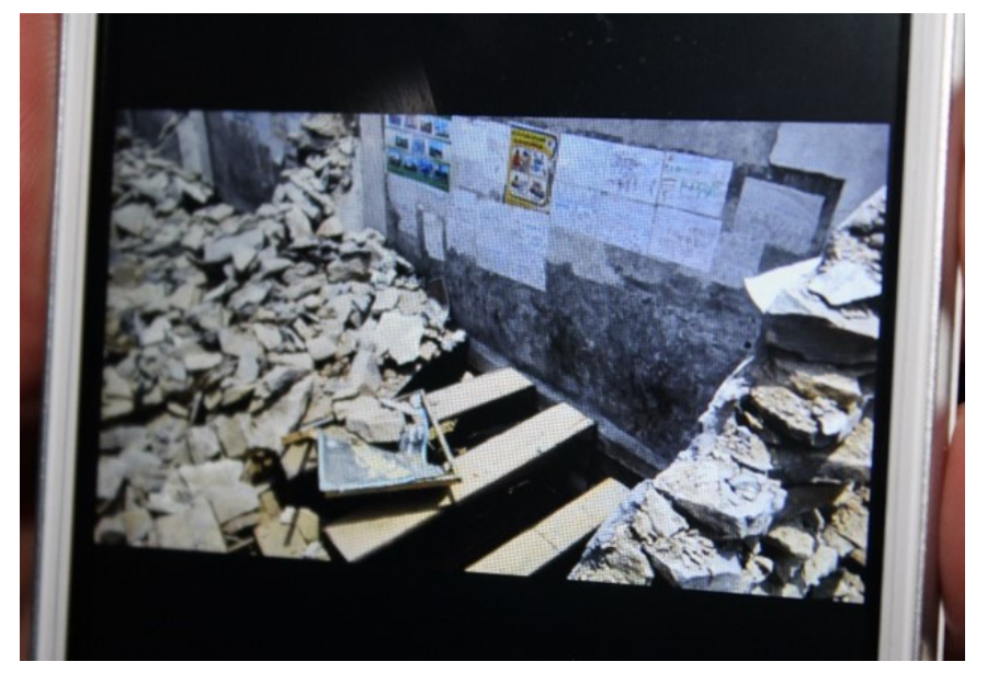
Figure 10. In Rasuwa, a poorly retrofitted stone school collapsed. Photos from the principal attest to the fact that few students would have been able to evacuate or survive the collapse.