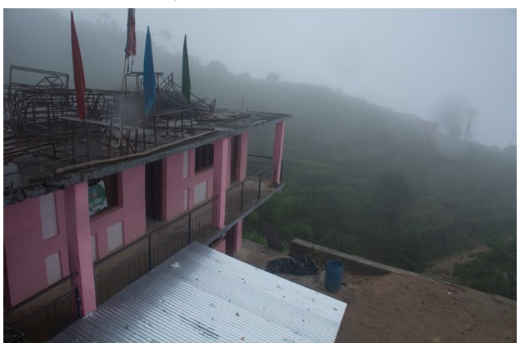
Figure 5. While a retrofitted school in Kathmandu performed well in this earthquake, retrofit design and construction flaws may lead to unnecessary damage in larger events. In the left photo, vertical bars poke out the bottom of a retrofit band. A horizontal retrofit band at the bottom of the wall is missing on this side of the building. On the roof top, the vertical bars are secured by only small patches of concrete, partially covered in the photo by discarded school benches. The masonry columns supporting the roof overhang were not strengthened in any way and remain unsupported below the balcony overhang.