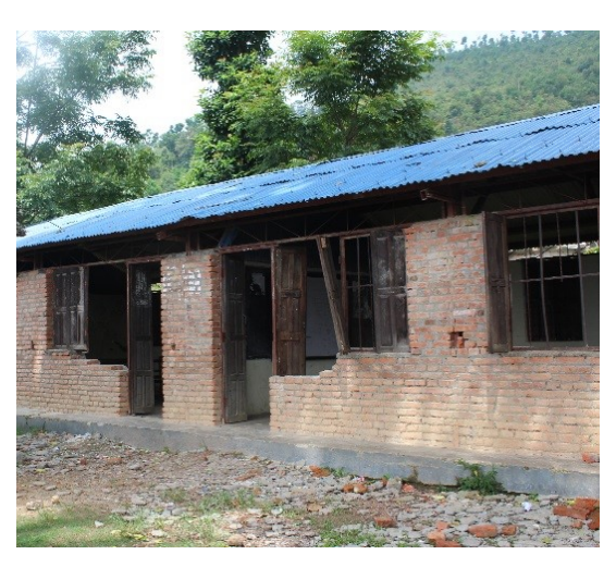
Figure 3. Metal frame template designs are common in rural and remote areas. While the frames were undamaged in the earthquake, the stone and mud mortar walls that used to enclose the school collapsed. These walls were considered non-structural. Communities were allowed to build them with available materials and without reinforcement. The vast majority of the stone walls collapsed down to about half a meter, showering the classroom with large, deadly stones. Brick walls were typically damaged and unstable, but collapsed less often. [Note: Rubble from collapsed stone and brick had already been removed when photos were taken.]