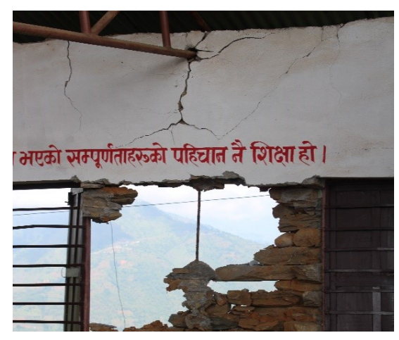
Figure 7. This teaching resource centre on school grounds was built with stone and mud mortar. The masons employed earthquake-safety measures, such as a reinforced concrete lintel band and vertical reinforcement in the walls. However, even with these measures, the heavy shaking in Sindhupalchowk caused the stone building to collapse swiftly and completely. It may be difficult to rebuild safe schools out of this brittle material unless alternative technologies are developed, tested and extensive mason training and strict oversight are feasible during construction.