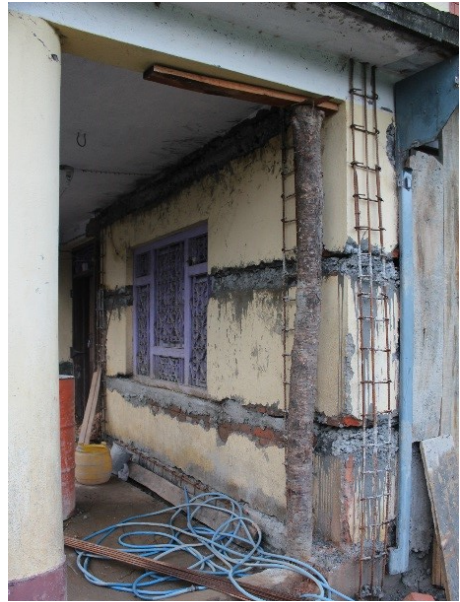
Figure 12. A mason in Bhaktapur drew how they now bent reinforcing steel into foundation footing, rather than simply cutting them at the foundation. The mason explained that he learned this technique as part of his school retrofit training. In North Kathmandu, houses near the school retrofit site were being retrofitted by adding bands and stitches two months after the event. The work was being carried out by local masons who had been trained to retrofit the school.