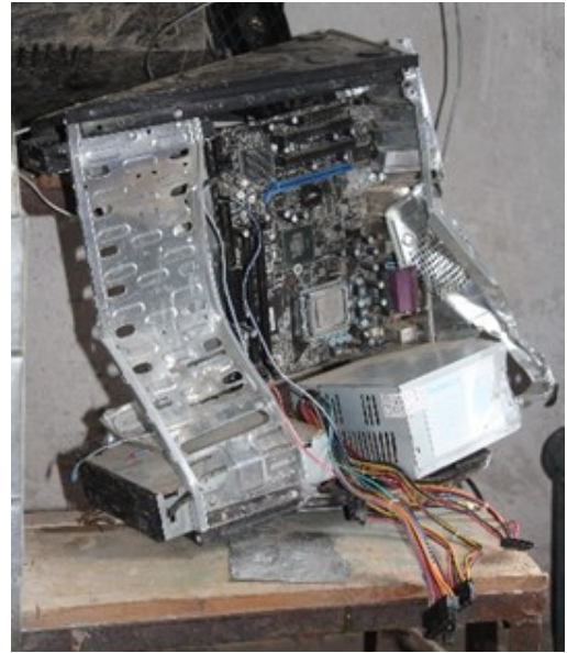
Figure 11. School computers and lab supplies were damaged where no non-structural mitigation measures had been taken.