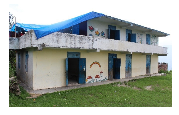
Figure 8. Two neighbouring schools were both built through international donor support. The left was built without technical support. The right was built after the community was given an orientation on earthquake safe construction and local masons were trained in safer construction techniques. An engineer and lead mason, both with experience in earthquake-safe school construction, carefully oversaw the process. After the earthquake, the second was operational; even the terrace had been covered and converted into a makeshift workshop for the local community.