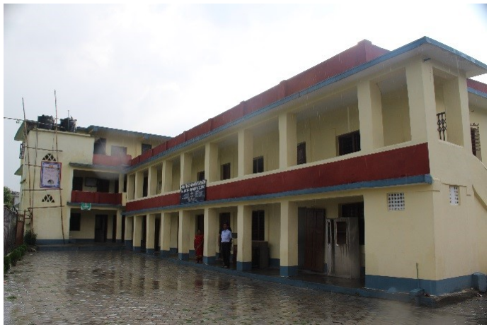
Figure 9. Community engagement in school retrofitting is vitally important in establishing the links between safe school facilities and best practices in school disaster management. Both school buildings shown were successfully retrofitted and undamaged in the earthquake. However, without community outreach and engagement, the staff and parents of the school on the left indicated they would have had students attempt to run out during the shaking, likely resulting in stampedes or students jumping from the second floor. The school would have likely experienced serious injuries and possible deaths. On the right, students and staff regularly discussed and drilled earthquake safety. Staff indicated students would have stayed in place during the quake, or dropped, covered and held on. The staff expected no injuries or deaths had the event happened during school hours.