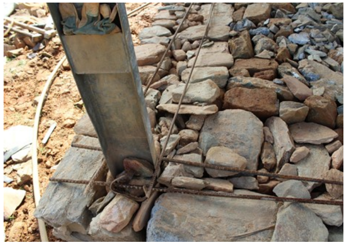
Figure 14. Untrained masons are already rebuilding school buildings without incorporating disaster-resistant construction techniques. The masons here were not measuring concrete materials accurately and were using only large aggregate in their mixture. When asked, the masons said that they learned to lay reinforcing steel bars shown from previous metal frame school construction. They were incorrectly laying rebar on the ground, without spacers, and without bar end hooks. The school buildings of which they spoke had collapsed or been badly damaged.