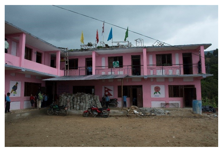
Figure 13. Both schools shown here were successful safer school projects – a new masonry building with lintel and sill bands on the left, and a retrofitted masonry building on the right. Neither provides highly visible signage to alert communities of the safer construction techniques employed, though the school on the left did paint a safe evacuation plan on the building. The lintel and sill bands are barely visible under the white paint in the left photo. The retrofit bands are highlighted in bright pink in the photo on the right, but could have been labelled as earthquake-resistant retrofit bands for an ongoing reminder of the project and of the community's exposure to earthquake risk.