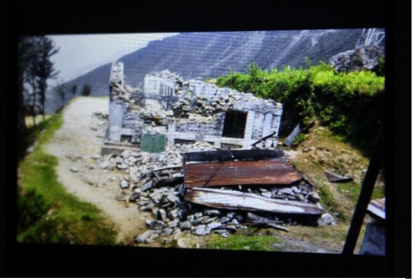
Figure 6. Donor-funded retrofit of a stone and mud mortar school in Rasuwa collapsed in the earthquake, as the principal captured and showed us on his smart phone after retrofit on the left and after the earthquake on the right. The rubble had been removed by the time of the survey. Little training of masons and nearly non-existent technical oversight ensured that when masons struggled to implement the retrofit design, the problems were not caught and rectified. The principal estimates 120 out of 140 students and staff would have died.