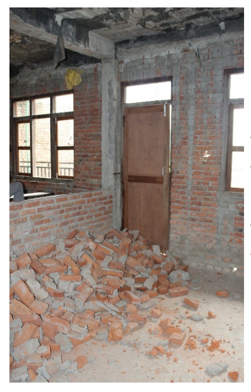
Figure 2. School building 101-1, which experienced only moderate shaking in Bhaktapur, was deemed unsafe for school use because unreinforced partition walls separated from the reinforced concrete frame and became unstable. Damage to unreinforced partition or infill walls can injure or kill students and block exits. The safety of these walls is routinely ignored by engineers and communities alike.

Cracks in these infill wall, although considered minor damage from a structural engineering perspective, were a serious problem in schools. Teachers and principals would demonstrate by pushing on the cracked walls, causing the walls to visibly move. With the risk that these walls could topple over and crush occupants in future aftershocks or earthquakes, many schools with infill wall damage were