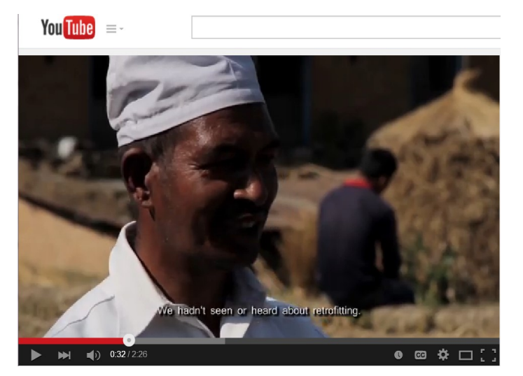
Figure 15. Research by Anne Sanquini, in coordination with the Department of Education and NSET, found that videos profiling local communities that engaged in school retrofits made viewers more trustful of retrofit and willing to support it in their own communities. The trailer can be viewed here:

Community engagement will need to be rapidly scaled-up to the regional and national level within the next few years to mobilise communities around safer construction and safer schools. Such efforts will be most effective if integrated with local government activities in reconstruction. Community awareness of risk and disaster-resistant construction techniques will enhance the quality of both housing recovery and community oversight of school reconstruction.